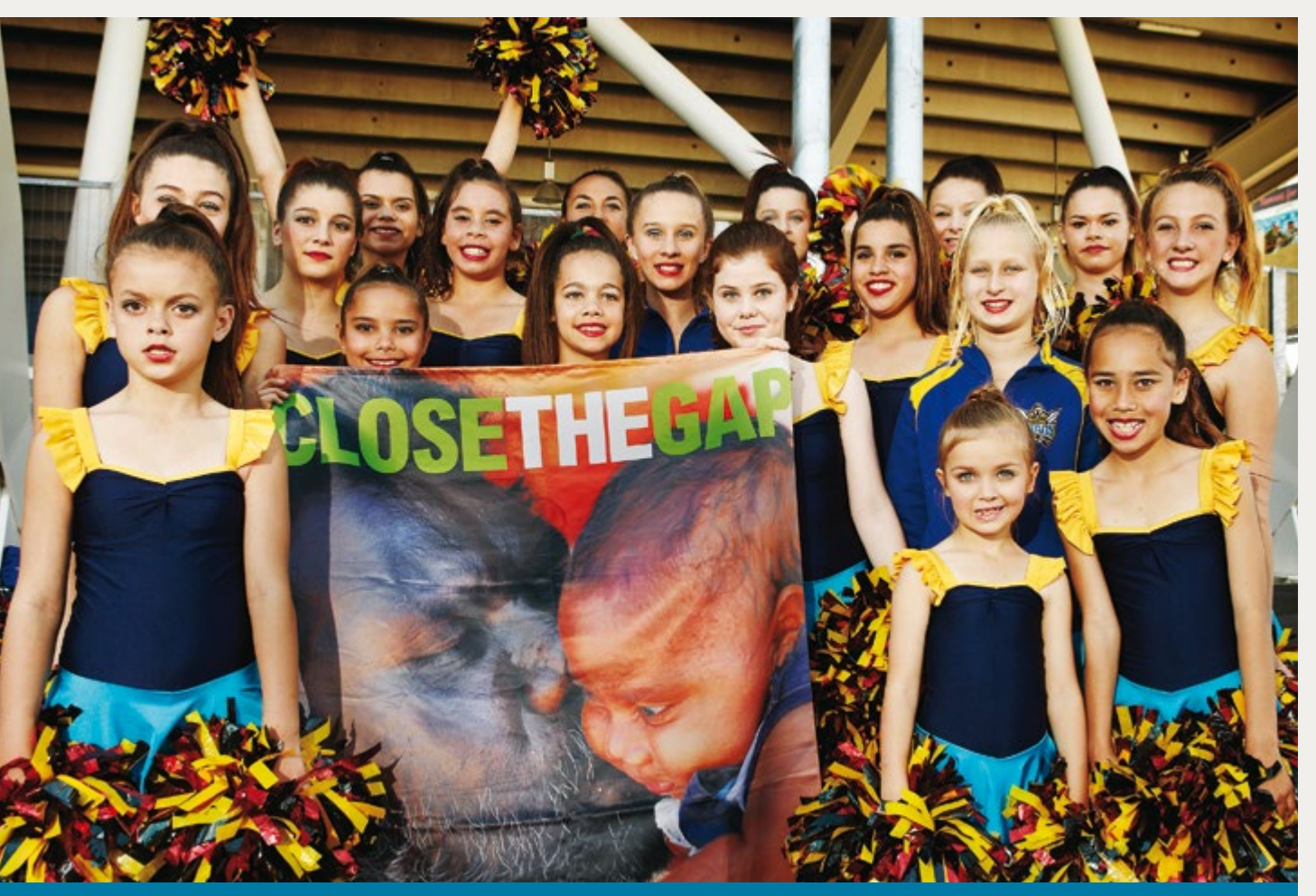
Close the Gap round hosted by the Gold Coast Titans 2012. The Titans have launched the 'I CAN' program to inspire Indigenous students in Surat and Bowen Basin communities to complete year 12 and pursue further education.