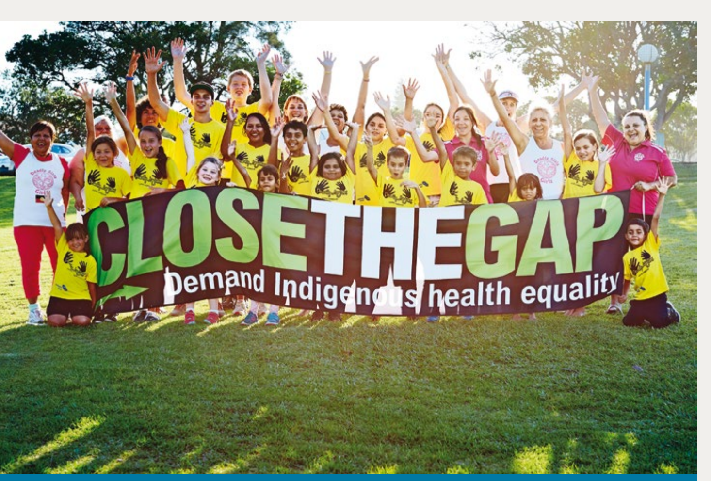
Deadly Sista Girlz, a community group for Indigenous women and the Deadly Jarjums, an off-shoot of the group, for kids aged five to 17. Coffs Harbour, NSW.

The Close the Gap Campaign Steering Committee (Campaign Steering Committee) calls on the new Australian Government to ensure policy continuity in critical areas of the national effort to close the gap, and to also take further steps in building on and strengthening the existing platform.