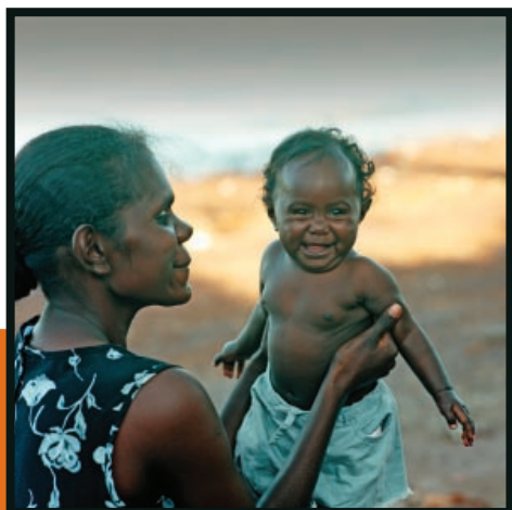
'Angelina and Baby' Bathurst Island, 2004.

Governments have made commitments to try and address Indigenous health inequality but always without a specified time frame.