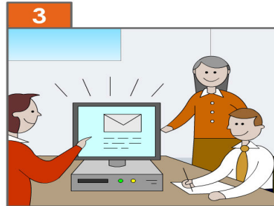
Parents then receive an email from CareforKids.com.au confirming the Child Care Centre Vacancy Alert Registration