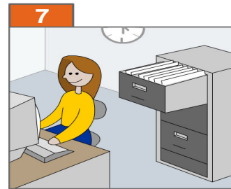
As a vacancy becomes available, Child Care Centres access the Child Care Vacancy Alert database to find families whose requirement matches their vacancy