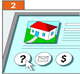
During the registration, parents are asked to specify the postcode/region where they are seeking a child care centre and also provide information about their child's age and the days that they require care