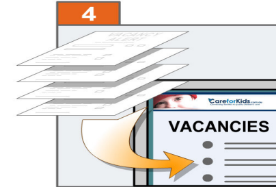
Parents registrations are collated into a database. This information can also be accessed by Child Care Centres in corresponding postcodes/regions