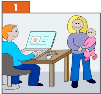
Parents register with CareforKids.com.au