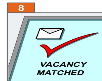
The Child Care Centre then selects a family to match their vacancy and contacts them direct

In essence, Child Care Centre Vacancy Alert widens the net by creating more opportunities and taking the search for a vacancy across a wider range of centres, therefore increasing the chance of finding a placement faster.