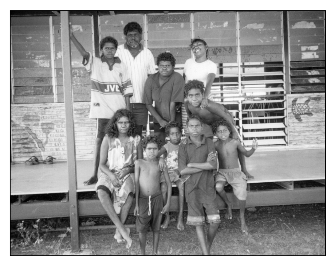
Students and staff at Wandawuy Homeland School NT.

The Sober Women's Group participates in teaching the students as described in the Youth Research Centre survey for the inquiry.