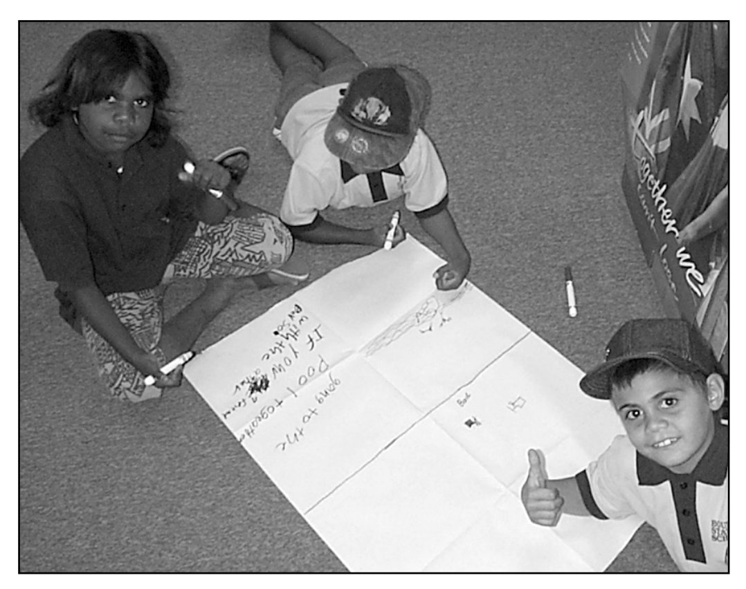
Students from Boulia State School in Queensland meeting with the inquiry during the 1999 Croc Eisteddfod in Weipa.

The Project established the Walgett Cultural and Education Centre in April 1998.