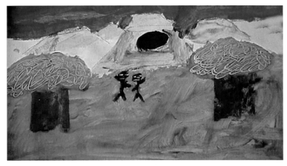
Long ago there lived two boys. They lived in a cave.