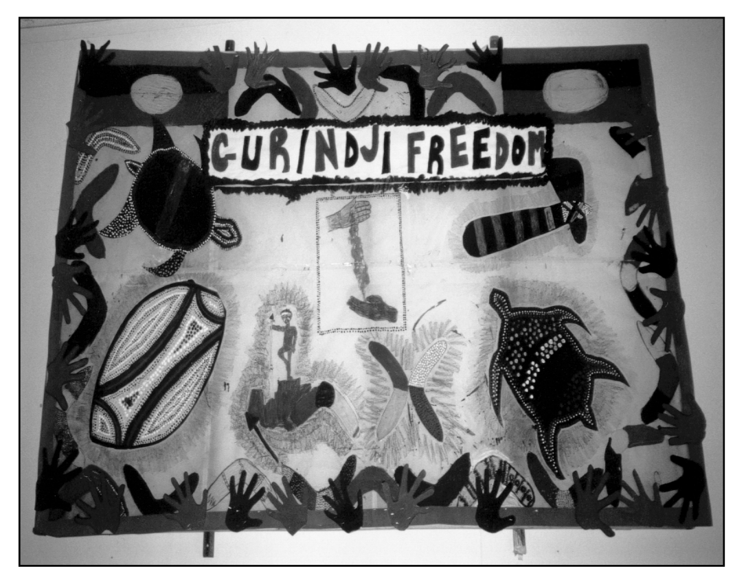
Mural at Kalkaringi Community Education Centre NT.

is what you have to do. Like, for example, if you want your kid to be literate, read to them, listen to them read. You've got to help them with their homework. Give them a place to do their study.' (Canberra hearing).