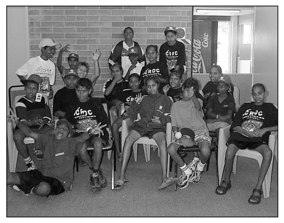
Students from Yarrabah in Queensland who met with the inquiry at the 1999 Croc Eisteddfod in Weipa.

The AEU's Ara Kuwaritjakutu project reported that the average salary level for an AIEW in 1994 was $18,590. In some cases there had been little change by 1999.