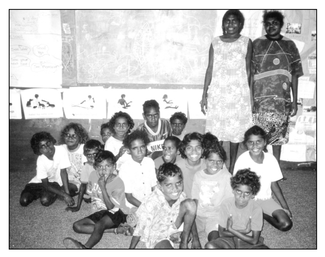
Students and staff at Bäniyala Homeland Community School NT.

The Commission's recommendations have the aim of increasing the numbers of well-trained AIEWs and teachers in rural and remote schools. The location and quality of their training and the suitability of their working conditions need to improve.