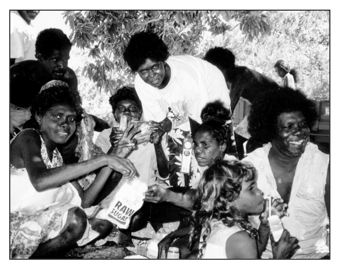
Barraratjpi Homeland (NT) community members meeting with the inquiry.

Many parents want their children to achieve at school, but are reluctant to become involved themselves because schools often make few concessions to the issue of Aboriginality and parents feel uncomfortable and shy about going into the school as they tend to see teachers as 'figureheads' and consequently may find the school situation threatening.