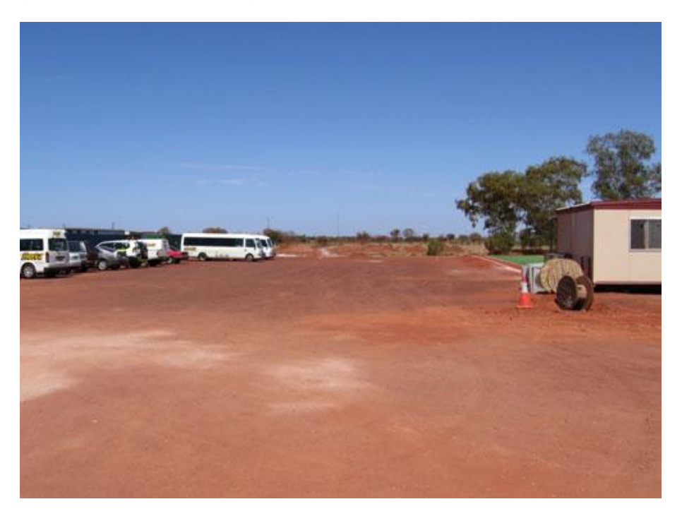
Car park outside fence of Leonora alternative place of detention, November 2010.

111. The Commission is concerned about the impacts of detaining people in extremely remote locations, including facilities at Christmas Island, Leonora in