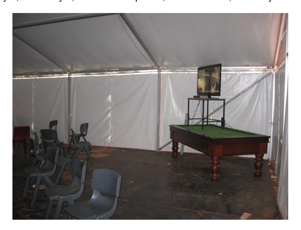
Marquee used as recreational space, Curtin IDC, May 2011.

171. The limited availability of regular purposeful activities in some places of detention appears to have resulted in high levels of boredom, frustration and tension. <sup>176</sup> In some places, space constraints and a lack of recreational facilities and toys appeared to be creating tensions between children and