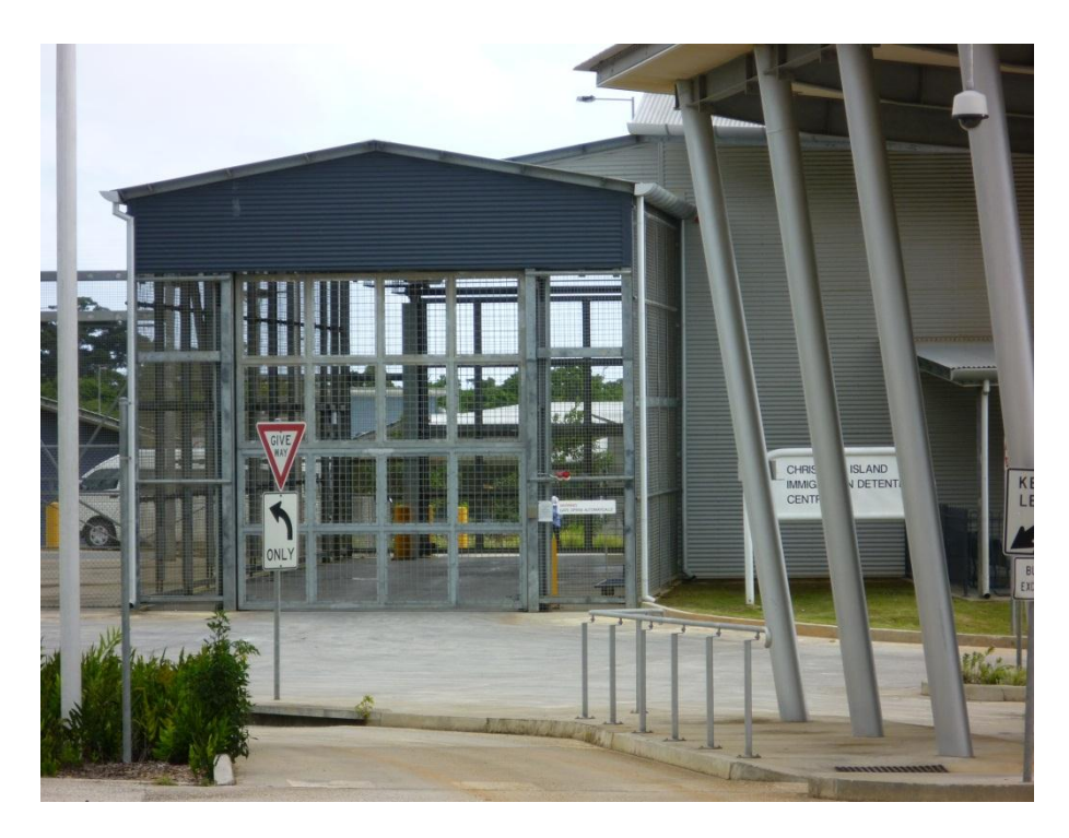
Entrance, Christmas Island IDC, May 2010.

123. The Commission has repeatedly raised concerns about the Management Support Unit or the Red Compound at the Christmas Island IDC. 115 The Red Compound looks and feels extremely harsh and punitive. The bedrooms are essentially small cells, with solid metal doors and grills on the windows. All furniture is hard and bolted to the floor. There are CCTV cameras in the bedrooms – including in the toilet and bathroom areas – which cannot be turned off. There is no outdoor space where detainees have an open view of the sky, and no open space where they can freely walk or run. The Commission is concerned that the Red Compound has been used on a number of occasions over the last two years.