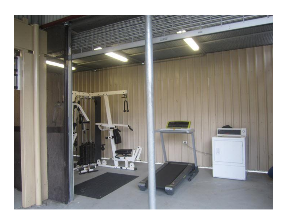
Gym, Dormitory 3, Blaxland compound, Villawood IDC, February 2011.