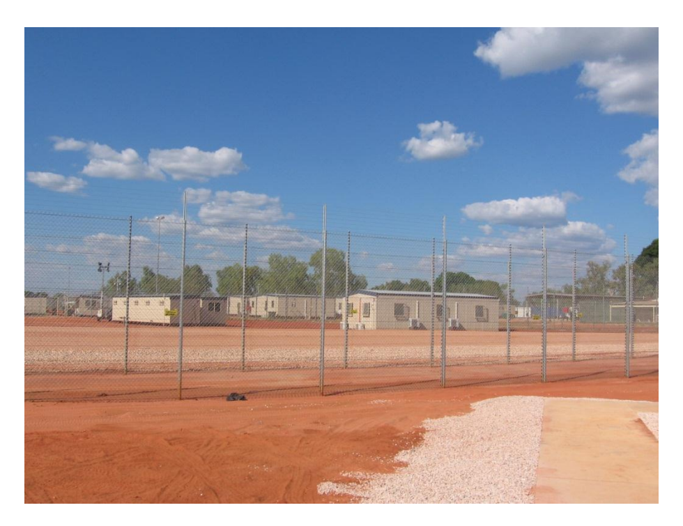
Looking into Curtin IDC through perimeter fence, May 2011.