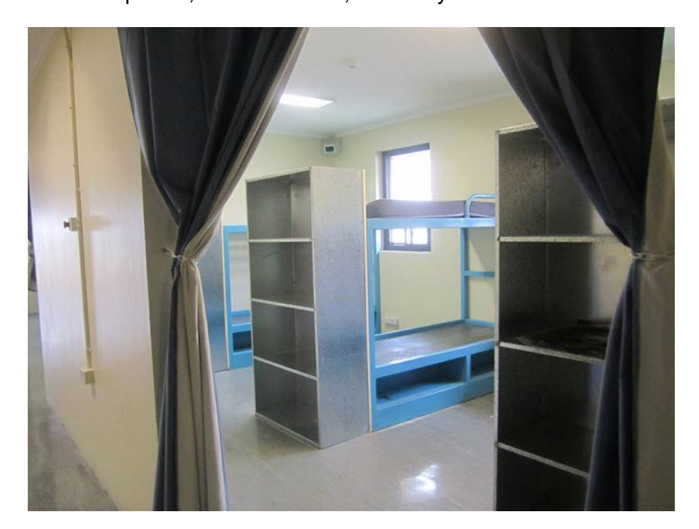
Blaxland compound, Villawood IDC, February 2011.

128. Other compounds at Villawood IDC are also a source of concern for the Commission. At the time of the Commission's most recent visit, for instance, people detained in Fowler compound were sharing small bedrooms with two or three other people. They had very little space or privacy, and no lockable space to store their personal belongings. 120