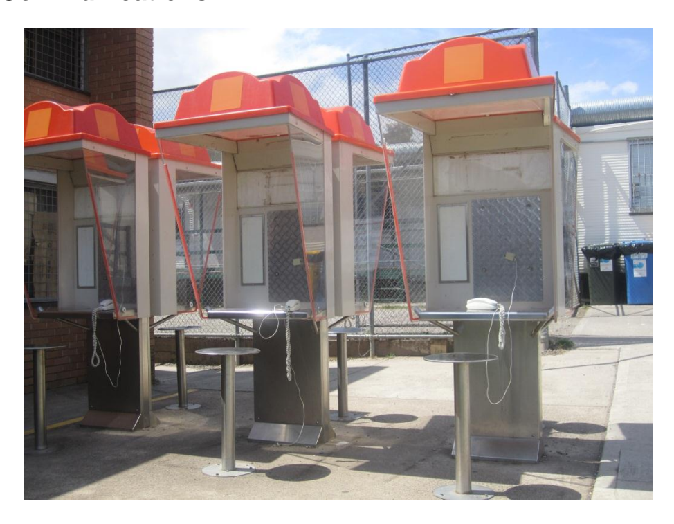
Telephones, Villawood IDC, February 2011.