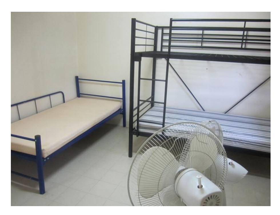
Bedroom, Fowler compound, Villawood IDC, February 2011.

129. The Commission welcomed the announcement by the Australian Government in May 2009 that funding would be allocated for a major redevelopment of Villawood IDC, and welcomes efforts made since that time in the planning and design phase. Pending the major redevelopment, some smaller interim works have been undertaken at Villawood IDC. 121 While the Commission welcomes these interim works, it remains of the view that the major redevelopment should be undertaken as soon as possible. 122