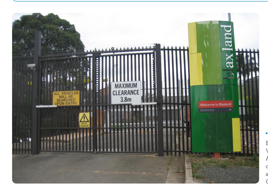
Blaxland compound, Villawood IDC Additional photos of Villawood IDC are available on the Commission's website

"Every moment of this place is very painful. I won't be able to forget this place." (Man in detention in Fowler compound, Villawood IDC)