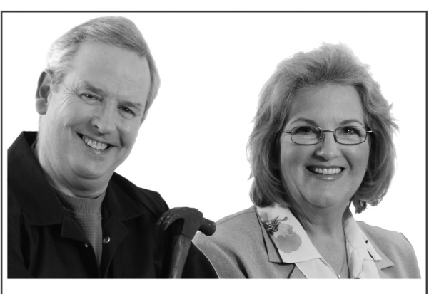
MATURE WORKERS MEAN BUSINESS

As one of the recommendations arising out of social research commissioned by HREOC, a print media and web-based campaign was developed during the reporting period to promote the benefits of employing mature age workers. The Mature Workers Mean Business campaign includes positive case studies from mature age workers and their employers and addresses a range of myths and stereotypes regarding older workers. The campaign also highlights the relevance of age discrimination protections in the workplace. The campaign will be launched in the next reporting period.